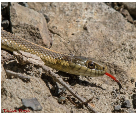
Pacific Garter Snake